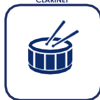
DRUMKIT & TUNED PERCUSSION